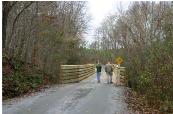
Tobacco Heritage Trail near Lawrenceville, Brunswick County