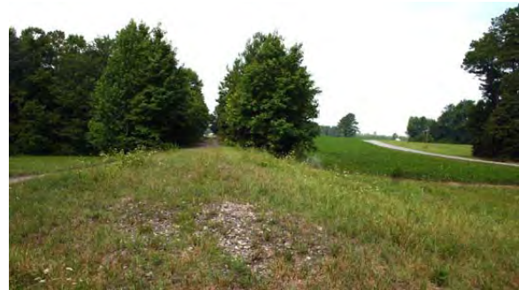
Virginian Railway corridor, Brunswick County