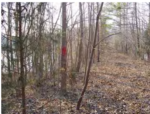
NF&D railroad bed east side of Rudd's Creek, Mecklenburg County

Phase 3 — Contract Amount: $406,499. Includes approximately 10.5 miles of trail in Brunswick County from Brodnax to Lawrenceville along the former Atlantic & Danville Railroad corridor (a.k.a. NF&D Railroad) connecting the two Phase 1 segments.