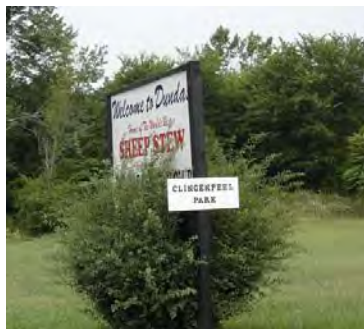
Virginian Railway corridor, Lunenburg County