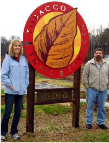
VDOT staff provided invaluable advice and expertise to bring this project to fruition. Thanks, Guys!

Phase I includes the segment in Mecklenburg County between La Crosse and Brodnax, as well as, the segment on the west side of Lawrenceville which includes the rehabilitation of three (3) bridges.