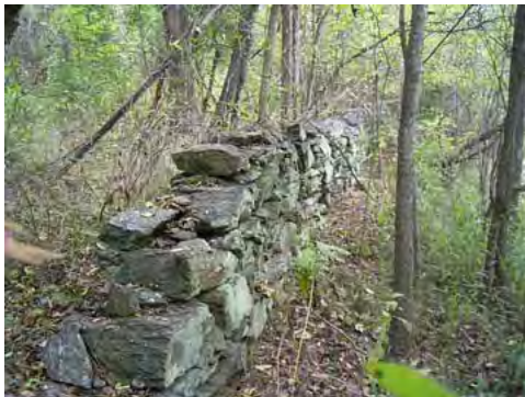
Trail Corridor near Berry Hill, Halifax County

Scope of Work: A&A will perform surveying and geotechnical engineering, perform preliminary and final engineering, prepare construction documents, prepare water quality permits, assist in environmental clearances, provide bidding and construction contract administration services, and provide resident project representative services for the trail segments as follows: