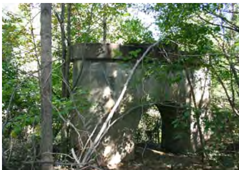
Meherrin River Bridge remains, Brunswick County

Phase 2 – Contract Amount: $167,309. Includes 2.4 miles in South Boston/Halifax County from Cotton Mill Park, then along a former spur track rail bed to the former Richmond and Danville Railroad corridor, and then terminating in the railroad corridor near the western boundary of the Berry Hill Plantation Site.