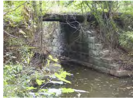
Trail Corridor, Halifax County